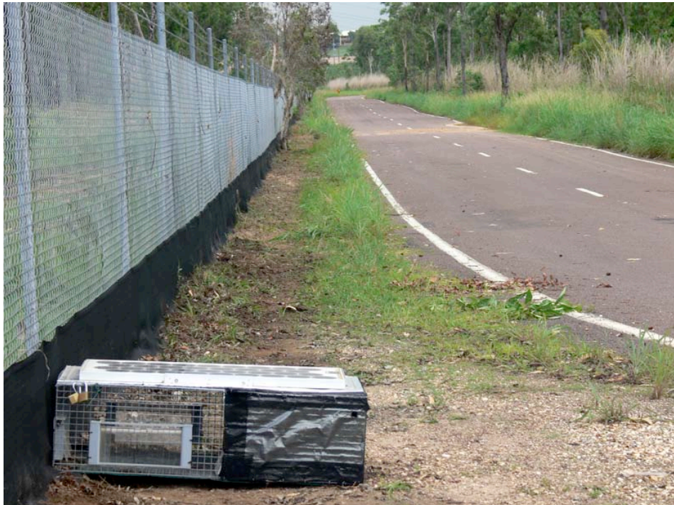
Picture – Sponsored trap on the Deflection fence at Hidden Valley.

We are confident we can reduce the numbers of cane toads even further by using deflection fences and traps. Our trials, see picture below, have shown that fences and traps combined can block toad movement and increase the effectiveness of the traps.